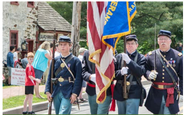
The Marshallton Memorial Day Parade

Please visit www.marshalltonconservationtrust.org