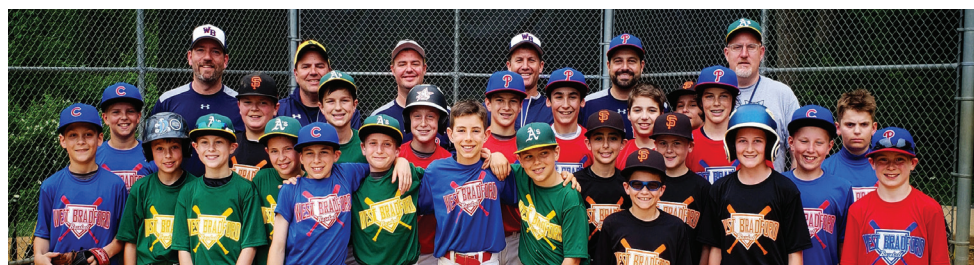
2018 Intermediate All Stars West Bradford Little League

Contact WBYA: (610)344-9444 www.wbya.org | office@wbya.org