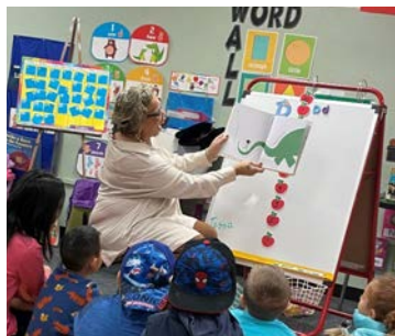
Preschool Story Time twice a week at the Coatesville Library!

We are pleased to announce a new virtual author series at the library! Community members have the opportunity to attend live, virtual talks 3 times each month with popular authors. Please visit our website at www.coatesvillelibrary.org and click the "Events Calendar" to see programs that are coming soon. These programs are completely free and recordings of past events are available to watch. Our Summer Reading Program is right around the corner! Keep an eye on our website to see the exciting events that will be happening this summer! 🌸