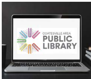
There is a new virtual author series at the Coatesville Library!