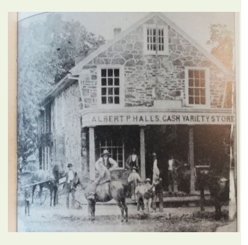
DO YOU KNOW WHAT IS IN THIS HISTORICAL PHOTO? See page 5 for the answer.

If you do not receive our monthly newsletter, please send an email to coatesvilleareapubliclibrary@gmail.com and request to be added to the list. We look forward to seeing you at the library!