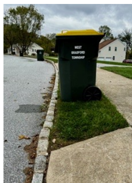
PROPER Placement During a Snowstorm