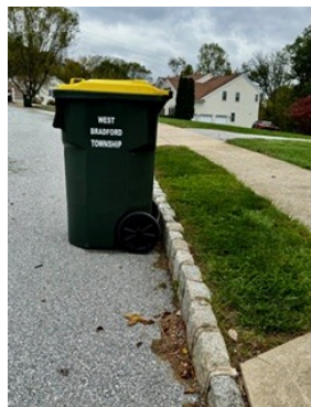
IMPROPER Placement During a Snowstorm

§ 368-10. Residential waste collection and disposal. (3) The toter shall be placed at curbside on a public street on the assigned collection day and must be at curbside no later than 6:00 a.m. The toter may be placed at curbside beginning at 6:00 p.m. on the night prior to the scheduled collection day and must be removed from curbside prior to 12:00 midnight on the day of collection.